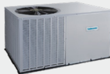
Packaged Air Conditioning Units