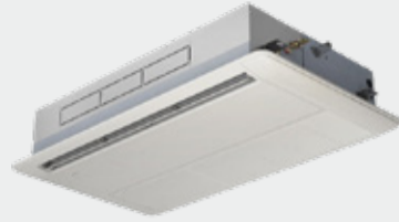
VRF Indoor Units