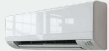
Wall-Mounted Split AC Units