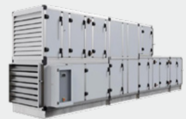
Air Handling Units (AHU)