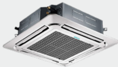
Cassette Air Conditioning Units