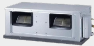
Ducted Split Air Conditioning Units