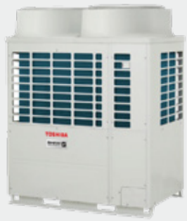
VRF Outdoor Units